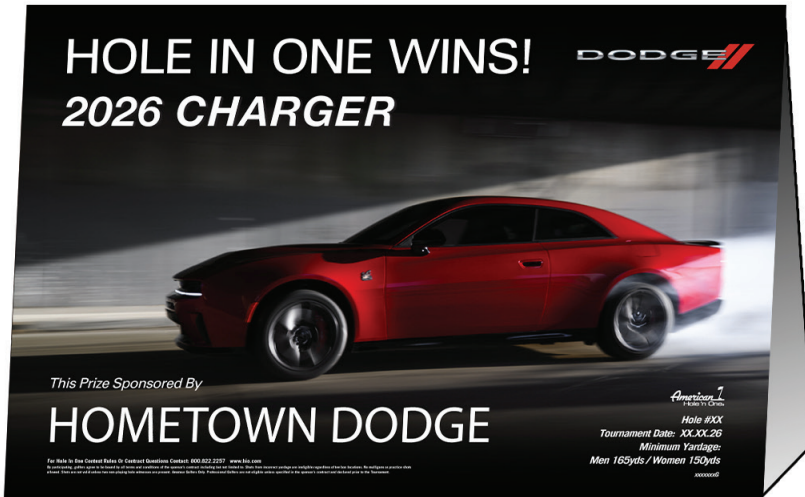
2' x 3' Personalized Main Prize Sign

PREMIUM SIGNAGE TO INCREASE DEALERSHIP VISIBILITY