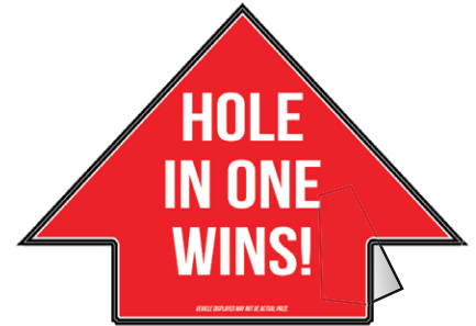
2' Arrow Sign