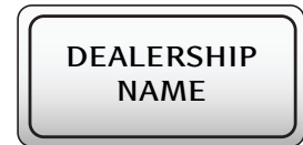
12" x 24" Vehicle Cling With Every Event You Sponsor

FREE CONTESTS AND PRIZES FOR EVERY ADDITIONAL PAR 3